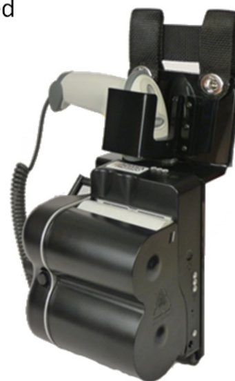
Hip Holster with LS2208 Scanner