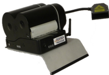
TableTop Mount with Gooseneck Scanner