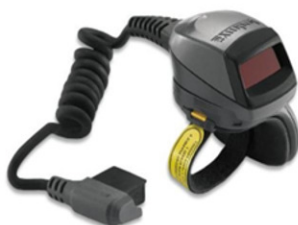
Hands Free Scanner